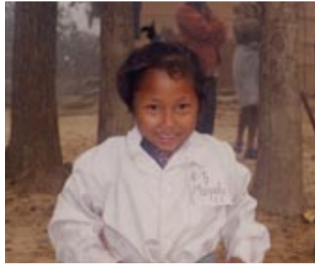
Mayalu, bonded at five years old, rescued by NYOF after one year of labor