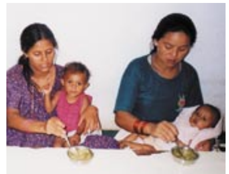
Nourishing the children, teaching the mothers

the Kathmandu facility and will support it for five years, after which the hospital has agreed to take full responsibility for running it. Next year, we hope to open another branch in eastern Nepal.