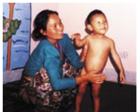
Mother and child - healthy and happy again after six weeks at NRH

be persuaded to say her piece. However, when she got started, she was full of confidence and passion. She told of coming to Kathmandu from her village, penniless, with her little son who was sick and acutely malnourished. She was afraid he would die, and did not know where to turn for help in this big city. Someone referred her to NRH, and she told the audience that at NRH her child was restored to health and she had learned how to cook nutritious food and to care for him in other ways. When she returned home, she would tell the other mothers in her village what she had learned. She is one of hundreds of mothers like her.