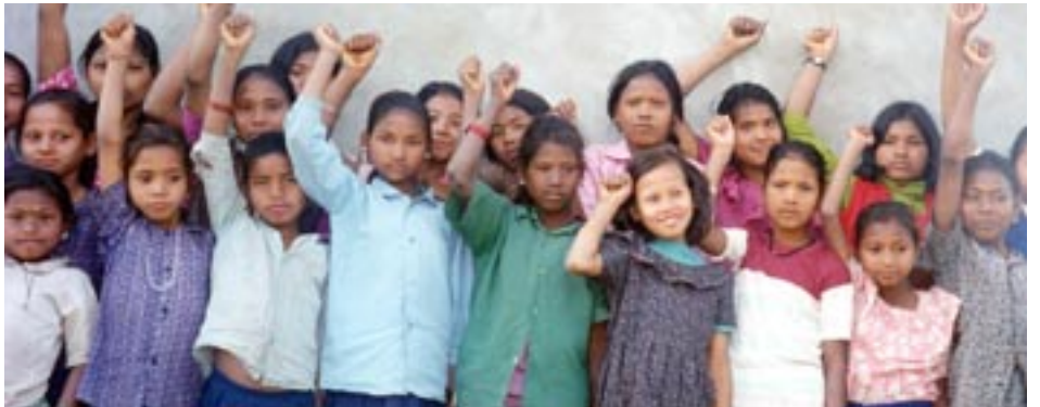
“Who wants to go to school?” All hands go up – and these little girls will no longer be forced to work as bonded laborers.