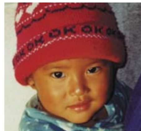
Another child rejuvenated at NRH

piglet, which could be raised on kitchen scraps and sold at the end of the year for about the same amount the fathers received for their daughters' labor. (And sometimes more, since piglets have a tendency to produce little piglets.)