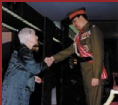
The King and I - NYOF wins an award