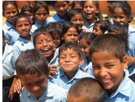
NYF scholarships break the cycle of poverty

College scholarships. Many bright, motivated Nepali students complete high school but have no hope of paying for college. You can provide a child with the means to earn a college degree. NYF gives priority to women, the disabled, and applicants of low-caste, who are severely disadvantaged in Nepali society. A college scholarship costs only $750 per year. Sponsors of a college student receive personal letters from the child, photographs, and updates from NYF's staff about the child's progress.