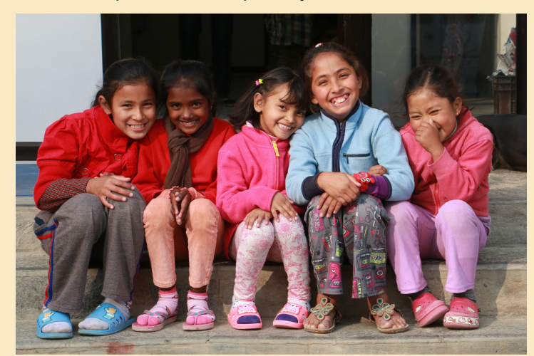
Olgapuri junior girls joke together on their front porch.

As children in Nepal go back to school, our global team is reflecting on all we have accomplished during the COVID-19 pandemic—especially in education.