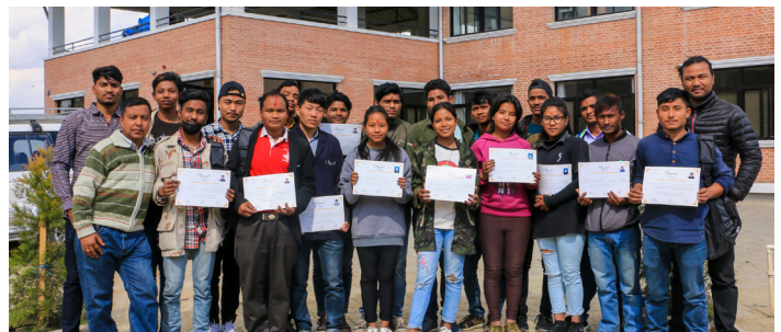
Congratulations to our recent graduates!

We're proud that more than 80% of NYF's vocational training graduates (including the Olgapuri Vocational School students) are employed in Nepal within three months of completing their training!