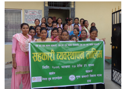
Freed Kamlaris learning Co-op management in the new building