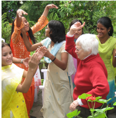
Dancing with EDD girls - 2006

At first, they struggled in school – the classes were in English; some had never seen a computer. We provided support, and lessons on caste discrimination and political activism.