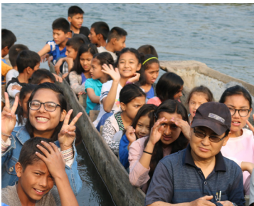
Canoeing fun in Chitwan

With a special party in their honor, all nine of the high school graduates transitioned from Olgapuri to shared apartments or private hostel rooms. As they prepare for college with NYF Scholarships , we're proud of these thriving young adults and excited for their futures.