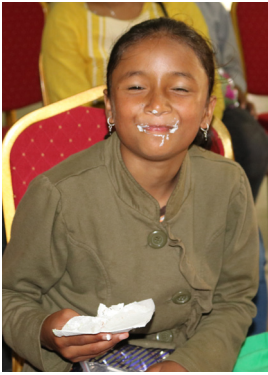
Time for cake!

From festivities to milestones to school graduations, your support has brought so many special joys to the young people of NYF this year.